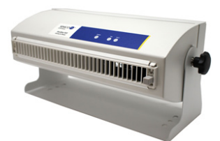
AeroStat XC2 Ionizing Air Blower