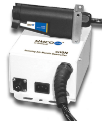
orION Ionizing Air Nozzle