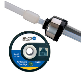
Model 6110/6110A Air Cartridge

The AeroStat XC2 provides extended coverage for a large surface area with industry-leading performance and advanced features.