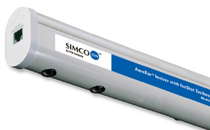
Model 5685 Ionizing AeroBar