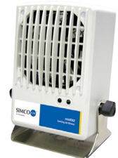
minION Ionizing Blower