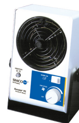
AeroStat PC Ionizing Air Blower