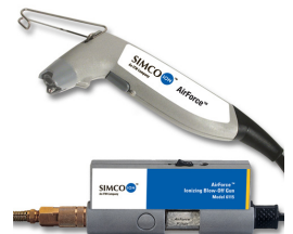
Model 6115 AirForce Blow-Off Gun