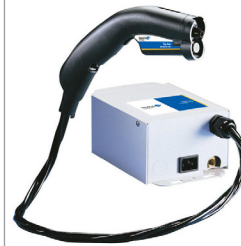
Top Gun Ionizing Air Gun