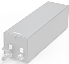
Compressed Air Inlet