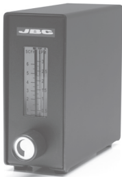
MN-A NITROGEN FLOW REGULATOR