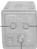
Power Cord Socket