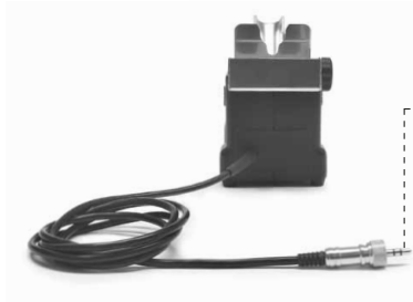
Stand Ref. JT-SD