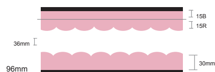
66mm ideal board depth