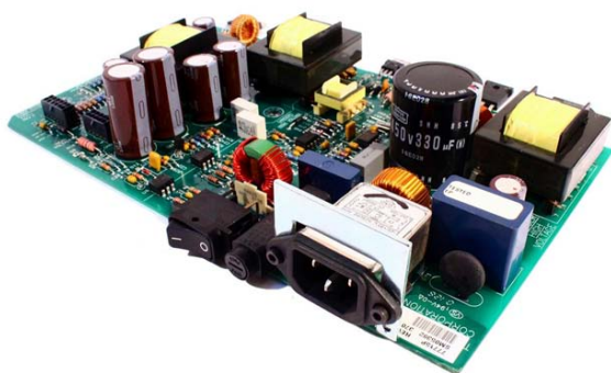
PCB depth of 28mm Most suitable Transit Pack = 64mm

On this PCB the components are evenly distributed, giving a constant height. As such this would be better placed in the 64mm depth of Transit Pack.