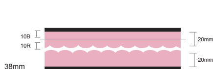
20mm ideal board depth

The following diagrams indicate the ideal board depth for each foam configuration.