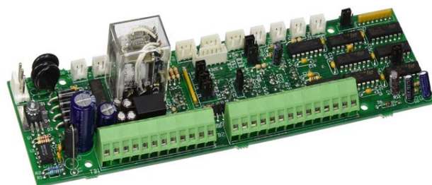
PCB depth of 32mm Most suitable Transit Pack = 38mm

On this PCB the components are evenly distributed, giving a constant height. As such this would be better placed in the 64mm depth of Transit Pack.