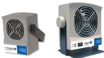
Model 6422e-AC (left) blower is ideal for in-tool confined spaces. Model 6432e (right) blower may be used inside tools or at a workstation.

The slightly larger Model 6432e has a tool mounting bracket or benchtop stand.