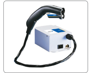
Top Gun Ionizing Air Gun