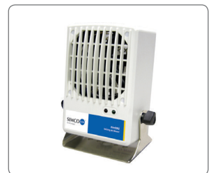
minION Ionizing Blower