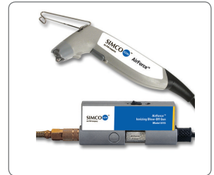
Model 6115 AirForce Blow-Off Gun