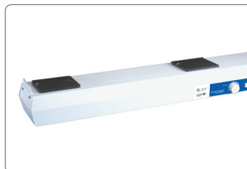
Aerostat Guardian Overhead Ionizer