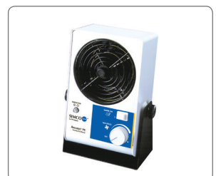
Aerostat PC Ionizing Air Blower