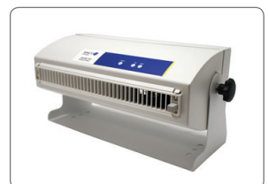
Aerostat XC2 Ionizing Air Blower