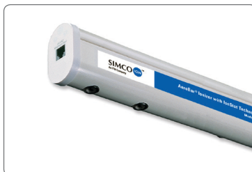
Model 5685 Ionizing AeroBar