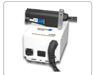
orION Ionizing Air Nozzle