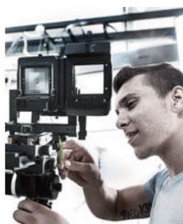
Holding function for recessed TORX® screws