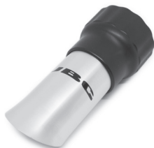
Metal Round Nozzle for Fume Extractor Ref. FAE083