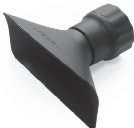
Rectangular Nozzle for Fume Extractor Ref. FAE080

You can replace the supplied nozzle and choose the one that best suits your needs.