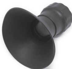
Round Nozzle for Fume Extractor Ref. FAE081