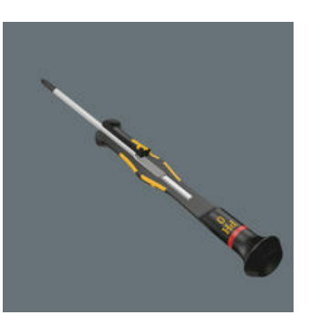
Multi-component screwdriver handle for ergonomic working.