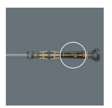
The fast-turning zone just below the rotating cap allows rapid twisting.