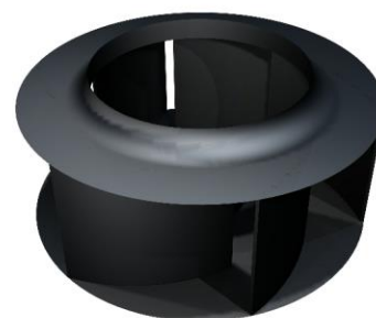
Energy Efficient Fan