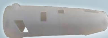
Tool cover BSTP