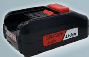
Lithium-ion battery BB200LI-25