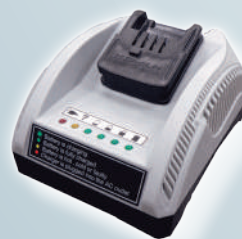
Charger CR19 - BTP