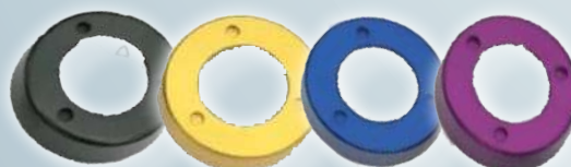
BSTP identification ring