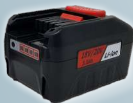
Lithium-ion battery BB200LI-50