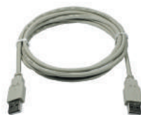
USB Com Cable

Delivered with the controller Code : 4-1042213