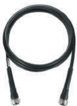
Driver Cable 3M

Delivered with the tool Code : 4-1042205 Option driver table 5m: Code : 4-1042250