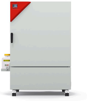
Model KBF-S ECO 240