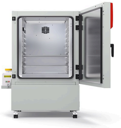
Model KBF-S ECO 240