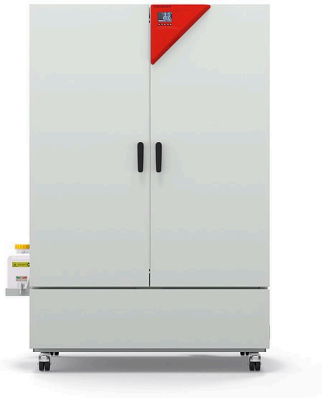
Model KBF-S ECO 720