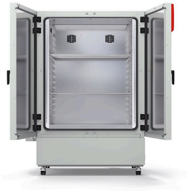
Model KBF-S ECO 720